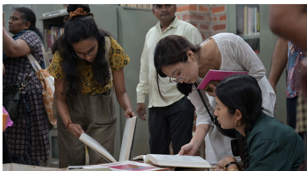
Library Reference Session

Titled ' Tribes in Transition ', the camp brought together 65 practicing Adivasi designers, artists, musicians and performers from the Munda, Kharia, Oraon, Tangkhul, Angami, Santhal, Karbi, Banjara, Bhil, Kachara and Rathwa communities from Gujarat, Maharashtra, Jharkhand, Orissa, Karnataka,