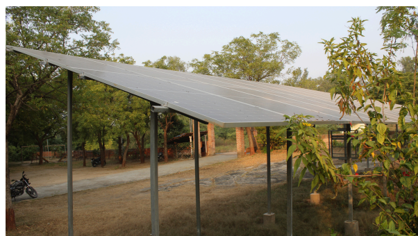
Solar Electricity Panels

To reduce the recurring energy costs at the Adivasi Academy towards electricity and LPG cylinder usage in the kitchen, Bhasha sought the support of the LIC Golden Jubilee Foundation, and set up a 20 KV Solar System on its campus. This includes Solar Panels for electrification and a hybrid Cooking System. Of this, 14 KV is the electricity requirement of the campus while 6 KV is utilised in the kitchen. The solar energy generated is transferred via grid to Gujarat Electricity Board. The Solar Cooking System installed at the Academy's kitchen enables cooking for about 200 persons at time. The system contributes to environmental betterment and economising costs.