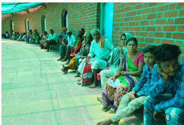
OPD at Tejgadh