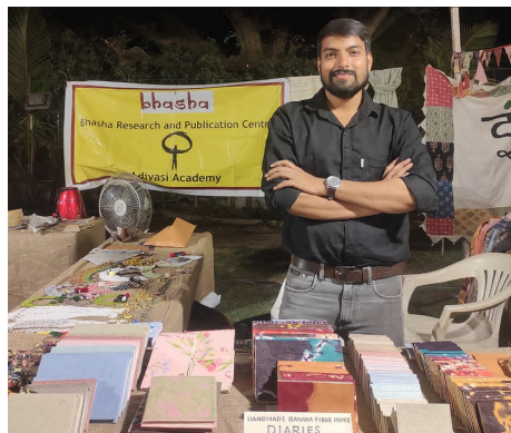
Banana Paper Products on display

Bhasha participated in the ' Farmers Nest Exhibition ' held to promote completely organic and chemical-free produce of farmers and entrepreneurs in Vadodara on March 15, 2024. Bhasha had on display banana paper products, Kasota textile and local art and craft.