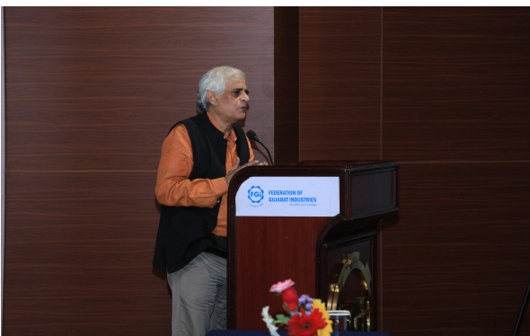
P. Sainath delivering the Parjanya Lecture

A decade after the closure of the 'Verrier Elwin Memorial Series' (1997-2007), Bhasha has instituted a new lecture series by the name, Parjanya . The lecture series marks the writer-activist Mahasweta Devi's demise in July 2016. Meaning 'rain' or 'cloud', the Parjanya lecture will be held during the monsoons, in July each year.